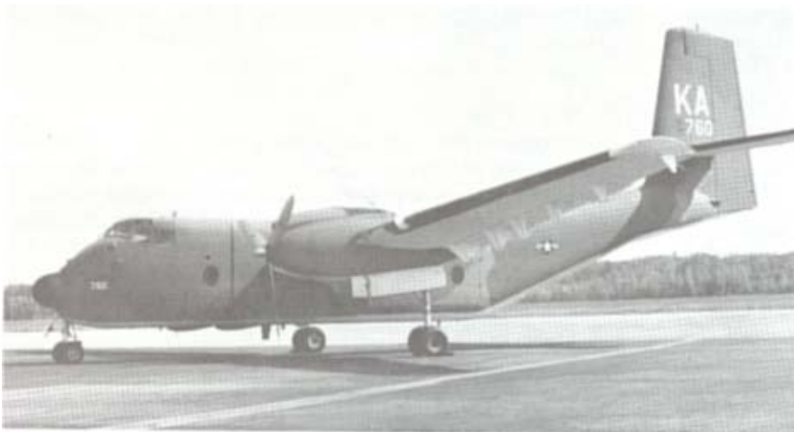
C-7 on display at Dover Air Museum

DON'T FORGET TO REMEMBER THE ALAMO! (REUNION)