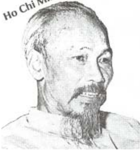
The man that made it all possible.