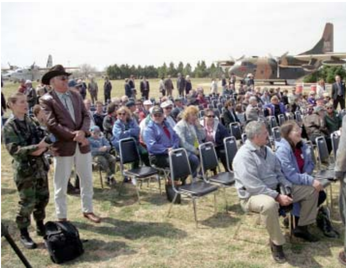
The attendees beginning to take their seats for the commencement of ceremonies.