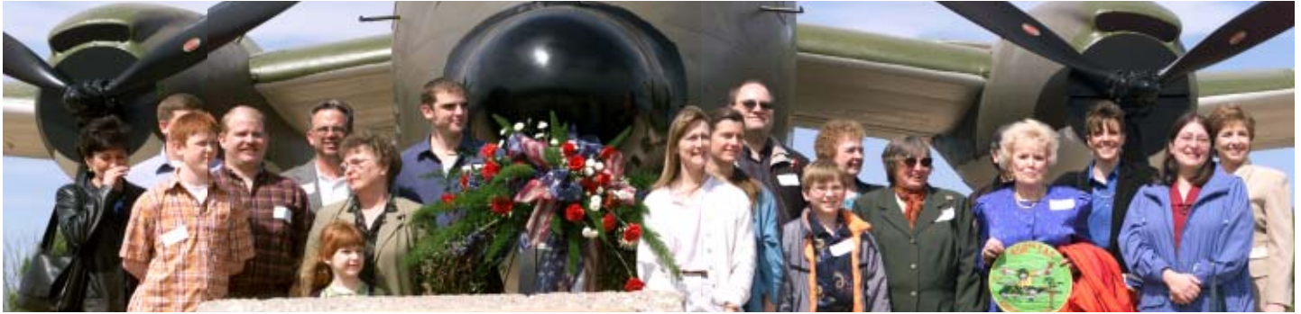
The entire group of honorees