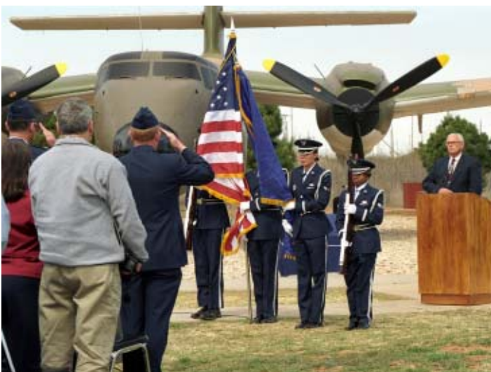
Uniformed personnel rendering honors as the colors are posted.