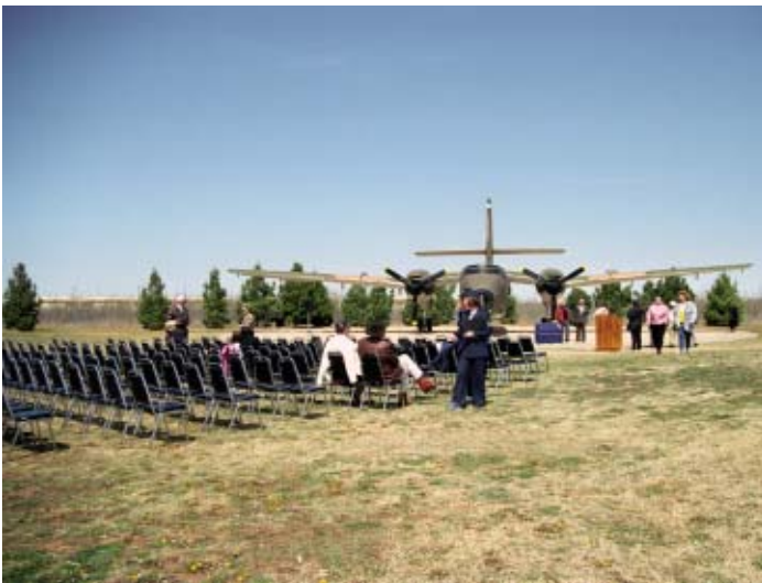
A general view of the aircraft and the seating for the attendees.