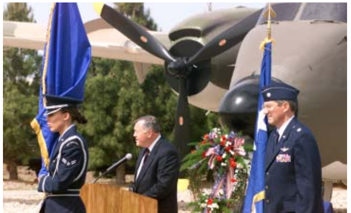
After the ceremony, everyone gathered around the aircraft and newly-dedicated memorial to talk and take a last look.